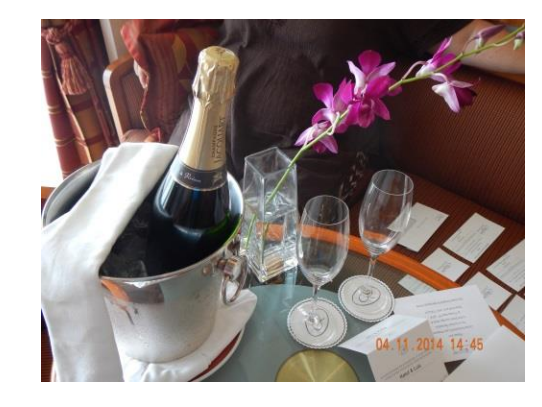
Our welcome bottle of champagne and fresh orchids.

Most everything is included in a Regent cruise. We started off each morning with a gourmet coffee like you would typically get at Starbucks but we didn't have to pay $6 for it. And if you want to add some Kahlua or Bailey's to it you could do so. No matter if you are in the dining room, in a lounge, or out by the pool you could get any cocktail of your liking throughout the day.