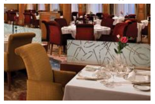
poached figs, fresh fruits, berries, melons, gravlax, kippers and much more. Each morning we had a choice of fresh squeezed orange juice and grapefruit juice.

<u>Compass Rose Restaurant</u> – This is the main dining room on the ship. Breakfast, lunch and dinner are all served in this beautiful dining room. All the food is very delicious and beautifully presented. Breakfast is pretty typical with some great traditional selections such as Eggs Benedict, eggs to order, fresh pastries and other selections such as fresh