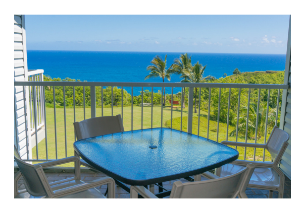
Incredible Ocean View!!