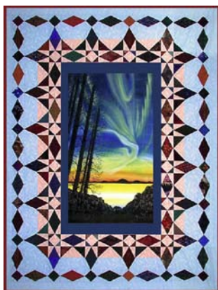
Fabric Panel from Frond Design Studios "Aurora Borealis"

Start with a panel or an unfinished quilt that needs a "wow" border. Then let me show you how to select and piece a border using some units based on the "Storm at Sea" block (shown below). Students will use my unique "Quilter's TRIMplate tools in class. This is a great way to learn a new technique without having to commit to a large project. Look for panels or interesting fabric as you shop and make a wonderful memento of your Alaskan cruise! Check out my Pinterest page for more border design ideas.