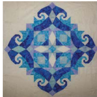
Whale Tails in Glacier Bay (Storm at Sea variation)