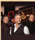
LARRY GATLIN & THE GATLIN BROTHERS