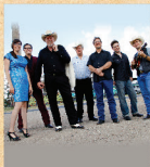
ASLEEP AT THE WHEEL