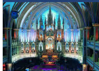
See the beautiful Notre Dame Basilica