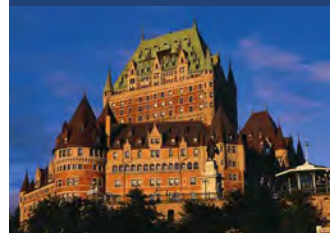
Enjoy a Guided Tour of Québec City