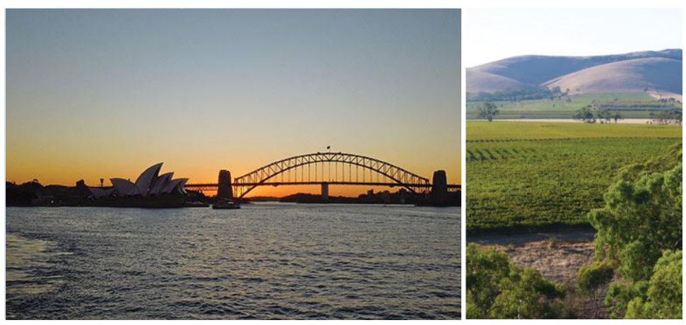
15 Days • 21 Meals: 12 Breakfasts, 2 Lunches, 7 Dinners