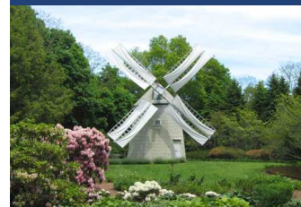
One of Cape Cod's many Windmills.