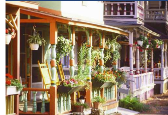
Historic seaside towns of Hyannis and Sandwich.