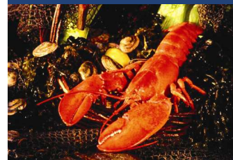
A New England Lobster Dinner!