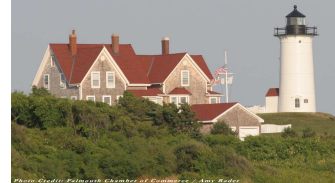
Lighthouse overlooking Vineyard Sound.