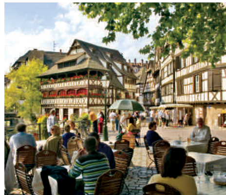
Meander through the quaint streets of Strasbourg, France

walls that provide contrast to the surrounding lush vegetation. With a late afternoon departure, the ship sails on to the charming town of Boppard. Following dinner, enjoy a special performance in the lounge by local German entertainers.