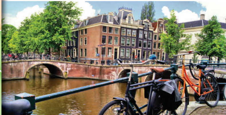
Lovely canals grace Amsterdam, the Netherlands