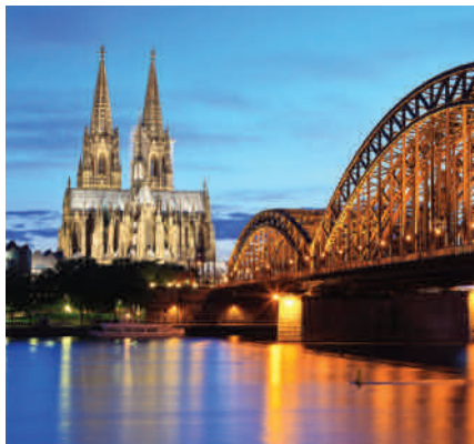
Cologne, Germany's imposing cathedral