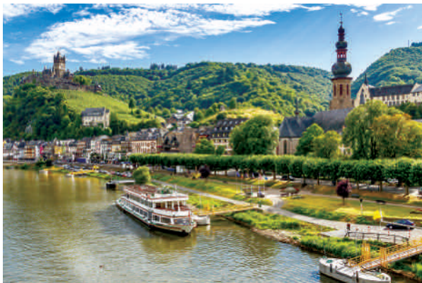
Reichsburg Castle stands guard over Cochem, Germany