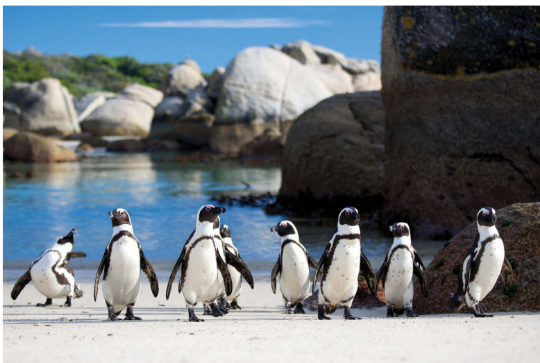
Jackass Penguins at Boulder Beach