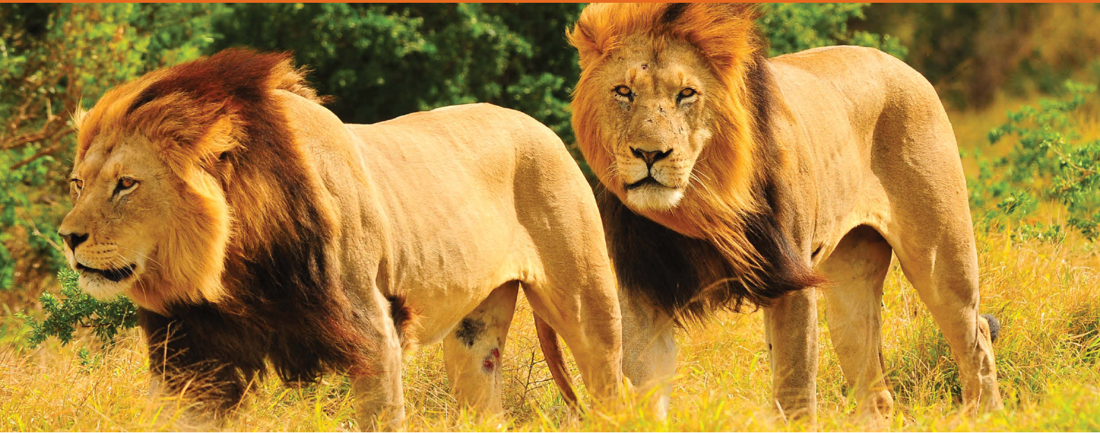
Spend two nights in Kruger National Park