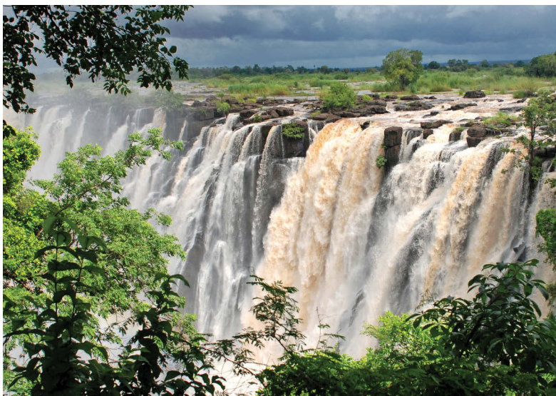
Witness the natural wonder of Victoria Falls