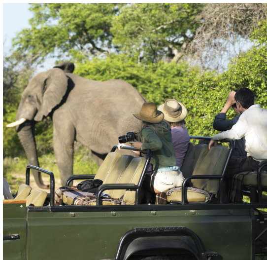
Enjoy a safari excursion in Kruger National Park

Home to prolific birdlife and numerous other game, you'll spend time with qualified guides in the African bush. Learn about the diverse wilderness and go in search of wildlife, including the "Big Five" – the lion, African elephant, Cape buffalo, leopard and rhinoceros.