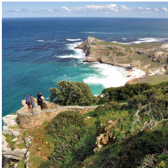
The Cape of Good Hope

The museum documents the history of the Malay people in the Cape, who were originally brought to the Cape as slaves. You will learn of the story of the local community within the national social, political and cultural context. You'll visit the oldest standing colonial building, the Castle Military and Iziko Museums, as well as the South Africa Museum, beautifully located at the top of the enchanting Company Gardens.