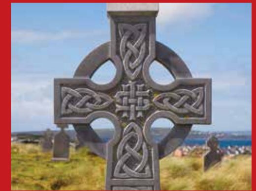
Aran Islands, Ireland