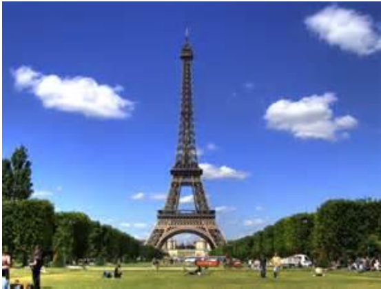
Eiffel Tower Paris

DAY 15 – Your journey of Europe's scenic, cultural, and historic highlights has come full circle. Transfer to the Frankfort Rhein-Main Airport for your return flight to the U.S.A. ( Breakfast )