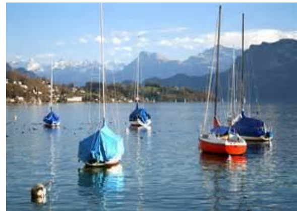
Lake Lucerne Switzerland

We hope you can join us on this trip of a lifetime!