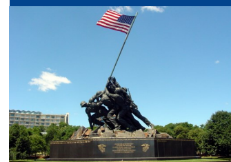
Iwo Jima Monument

*Price per person, based on double occupancy. Add $120 for single occupancy. Final Payment Due: 5/3/2015