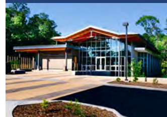
New Blue Ridge Parkway Visitor Center.