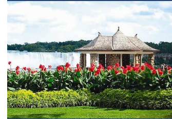
Visit beautiful Queen Victoria Park