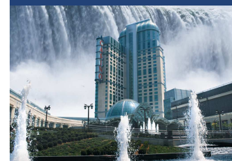
Gaming at Fallsview Casino