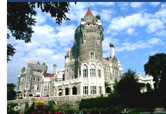
Magnificent Casa Loma Castle in Toronto