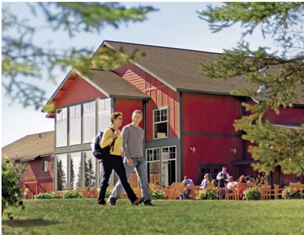
Take a walk on the nature trails around the lodge