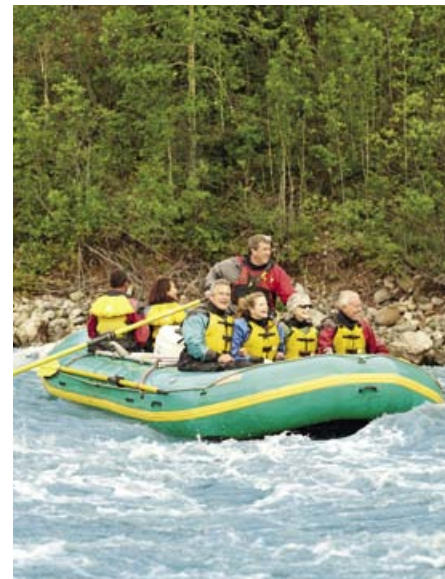
Ride the rapids on an exhilarating river-rafting excursion