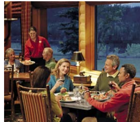
Savor authentic Alaskan seafood at the King Salmon Restaurant