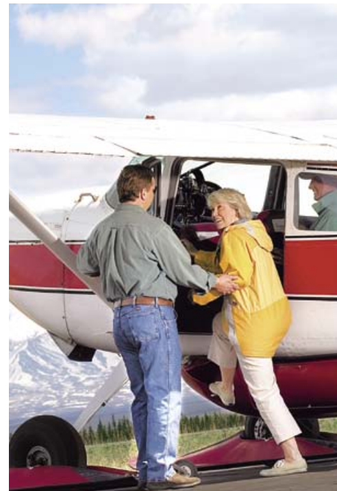
Explore the wilderness on optional flightseeing excursions