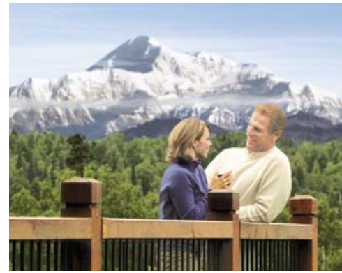
Marvel at spectacular Mt. McKinley and picturesque Denali from the lodge