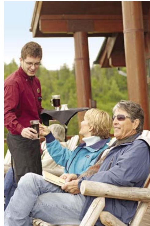
Relax and enjoy warm, welcoming service at the lodge