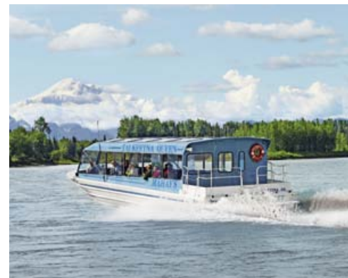
Take a thrilling jet boat ride through stunning scenery