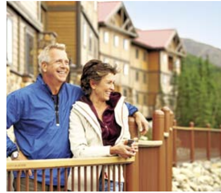
Take in the scenery on the expansive deck overlooking the Nenana River