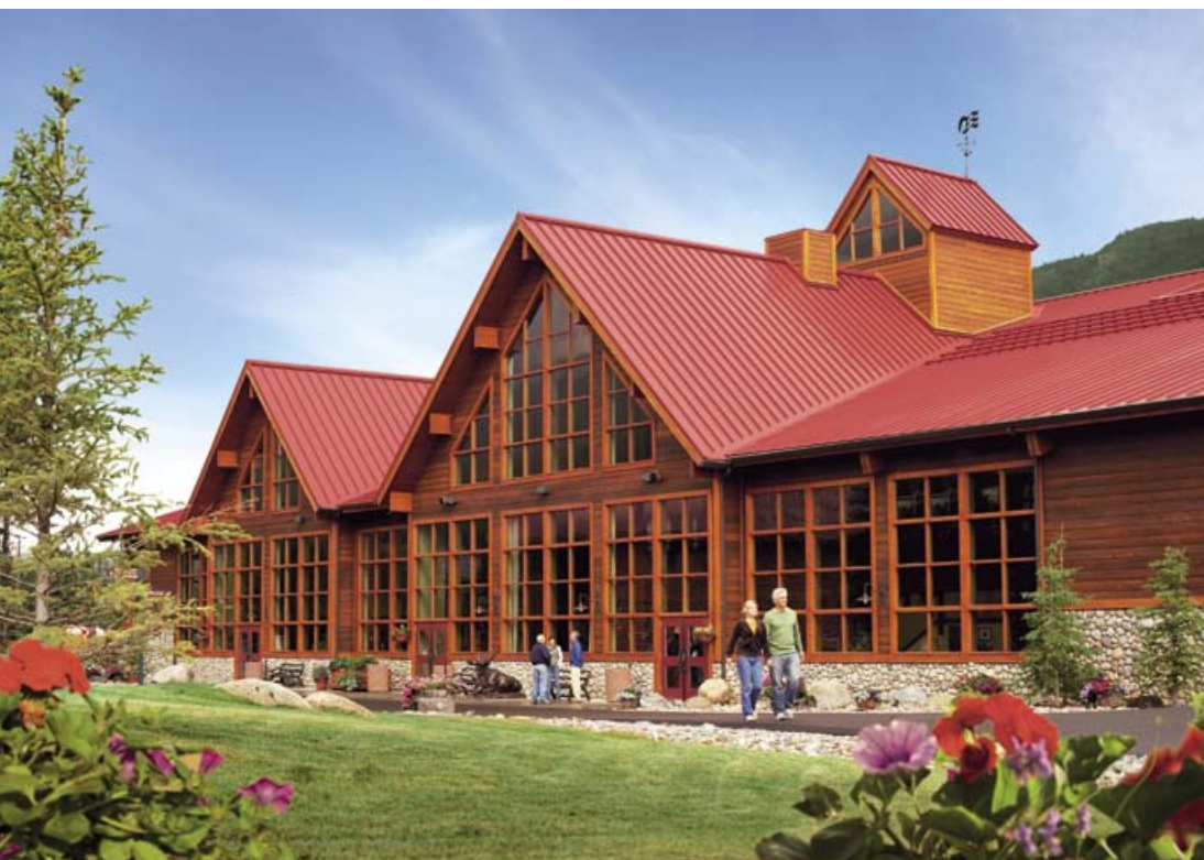
Stroll the grounds at the Denali Princess Wilderness Lodge