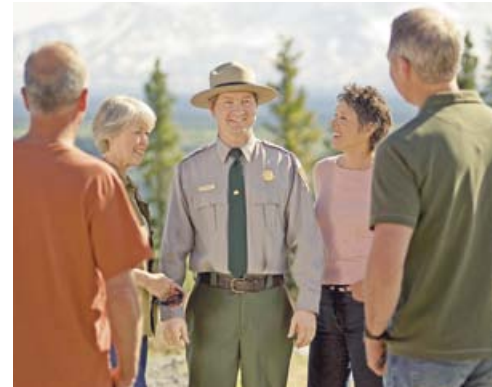
National Park Rangers share their knowledge of Wrangell-St. Elias