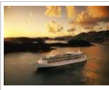
Vision of the Seas

A Premier Travel will make a donation to Soroptimist for