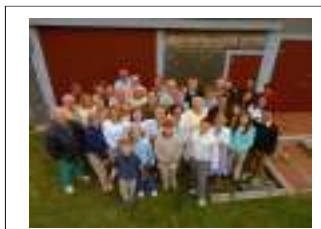
Multi-generation family reunion

all-inclusive, you don't need to find caterers, a ballroom and all of the other necessities for your reunion, we han-